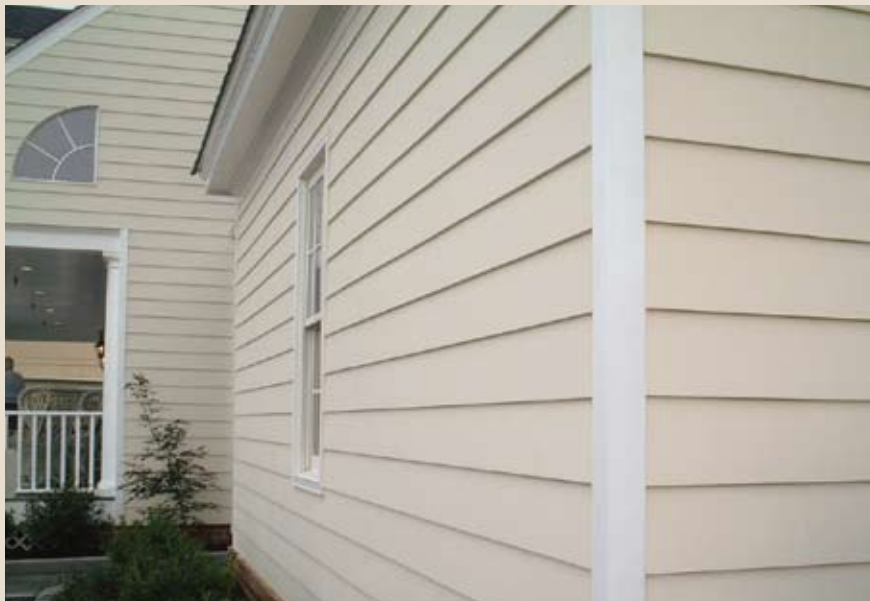
Sierra Premium™ Smooth Painted