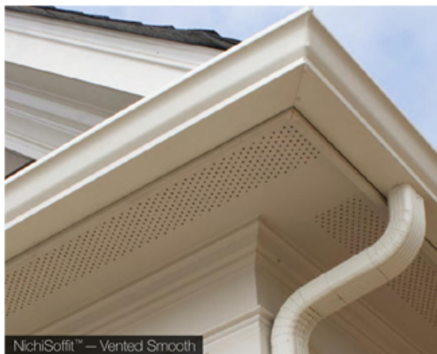
NichiSoffit™ – Vented Smooth