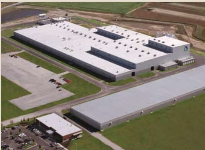
Nichiha fiber cement manufacturing facility in Macon, GA – Opened, 2007, recycles 95% of water used in manufacturing process and uses natural by-products and recycled materials in all NichiProducts™.

Establishing our headquarters in Norcross, Georgia in 1998, Nichiha USA began importing fiber cement panels for the US residential and commercial construction markets. In 2007 we began our largest expansion to date with the construction of our 300,000 square foot Macon, Georgia fiber cement manufacturing facility.